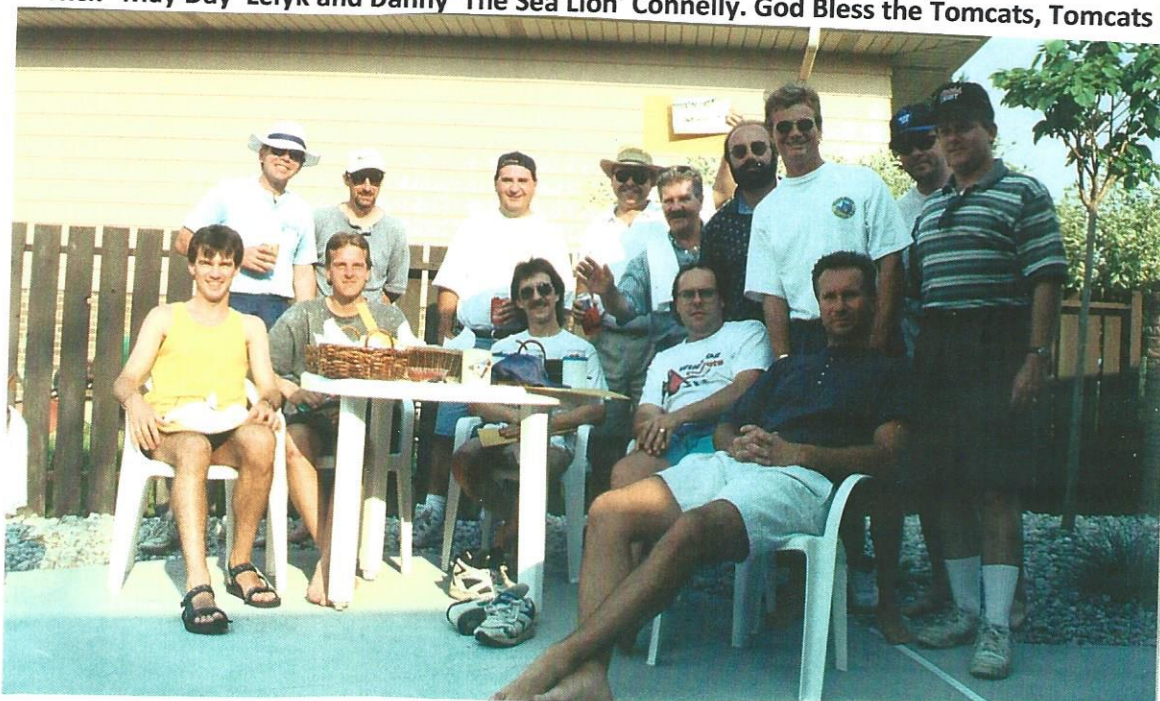
This is the last St. Felix. The Staff at the St. Felix would like to thank everyone for reading the St. Felix over the years