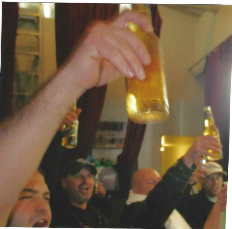
TOMCATS CHEER THE GREEN GIANT AND SING TOMCATS FORVER.

Don't be a stranger Green Giant, you know the words to 'Tomcats Forever', hummm it to yourself at night when the tears come and know that you will be missed and remember you are a Tomcat Forever!