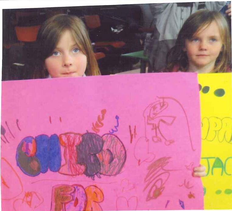
Fans come all over the world to watch the Tomcat Tournament