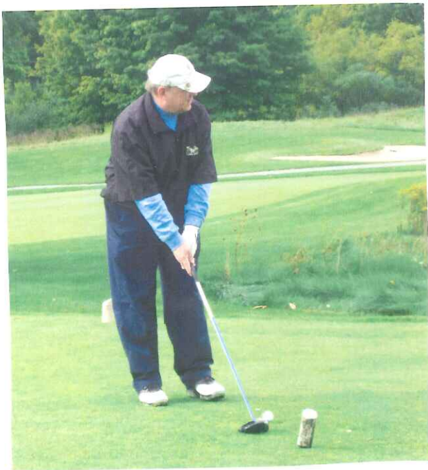
The Sea Lion is ready to tee it up at this years Tomcat Golf Outing....are you? Snowpants will be providing more details soon Go to web site or see Snowpants.