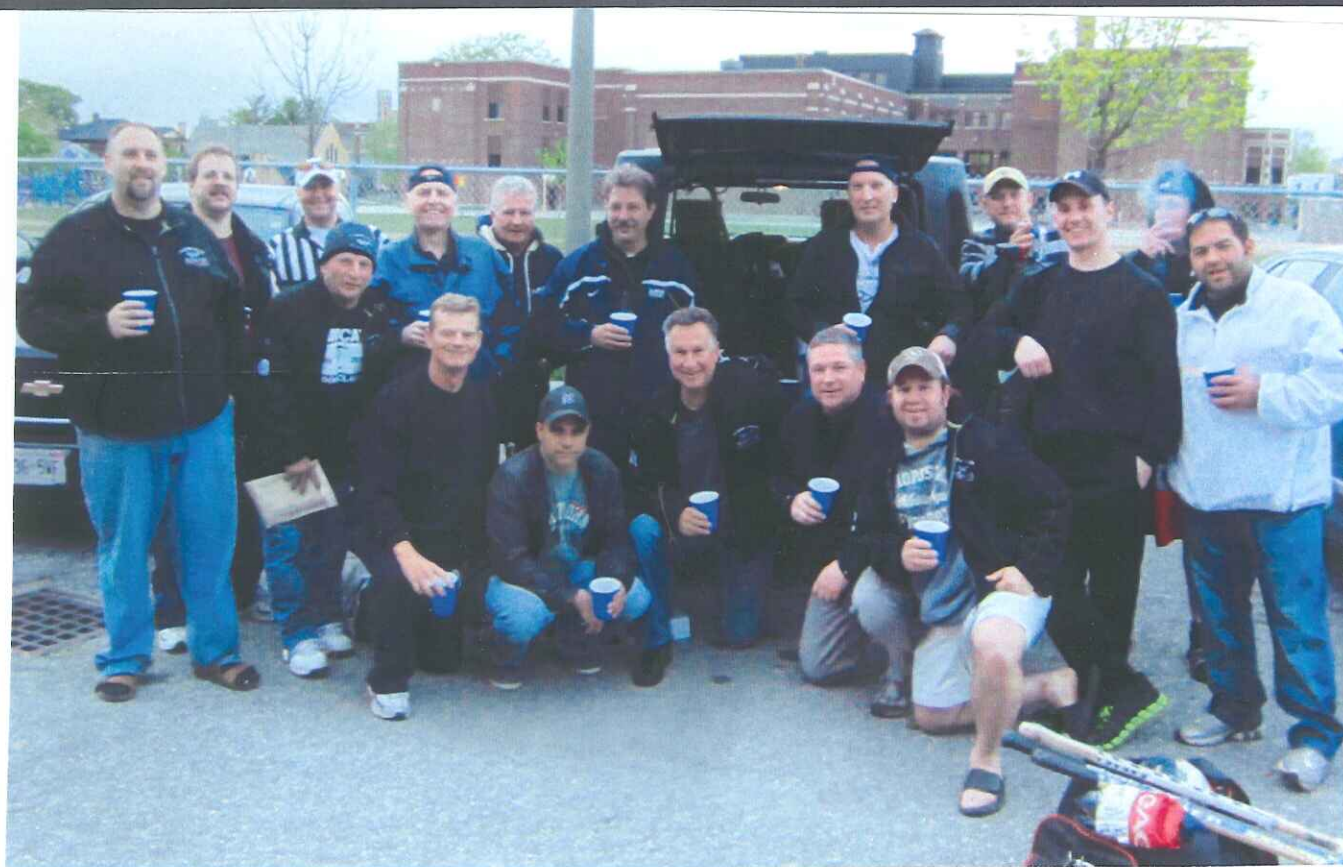
Any time you put 20 Tomcats together, it is always a great time, no different for the outdoor game, coming at the end of April. Hockey, a little tailgating, pizza and some Honey Vodka and of course the "Tomcats Forever" song, sung to the card crowd!