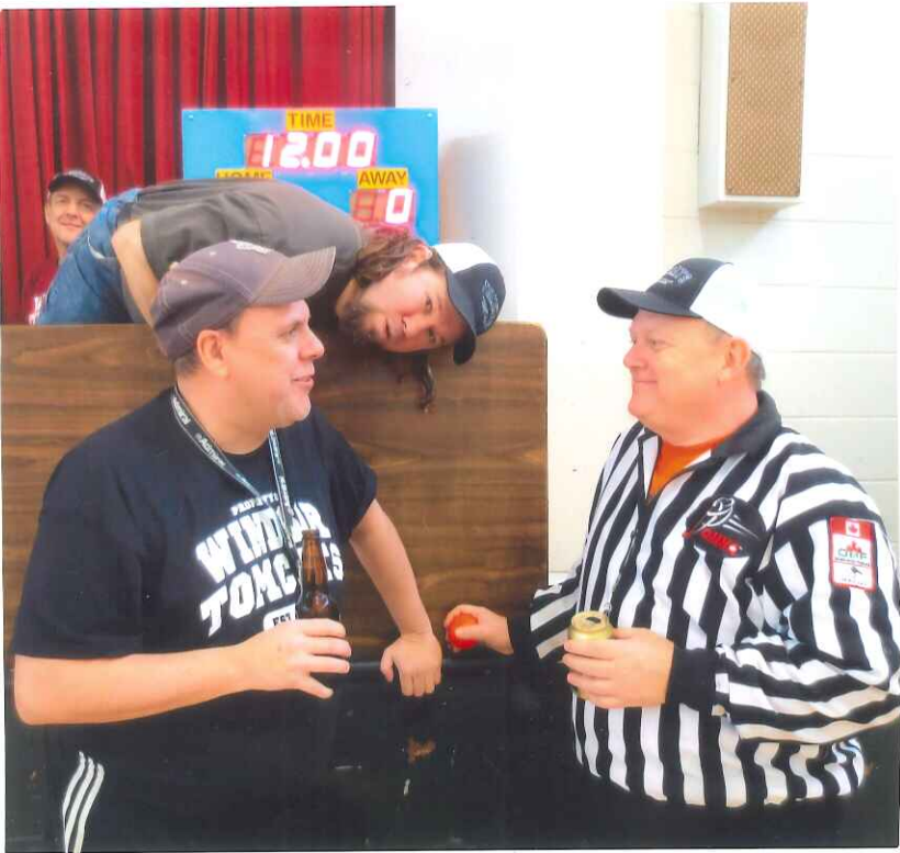
As always, there will be refs at the tournament and a two man reffing system will be in place, one on the floor and the other on stage watching the games.