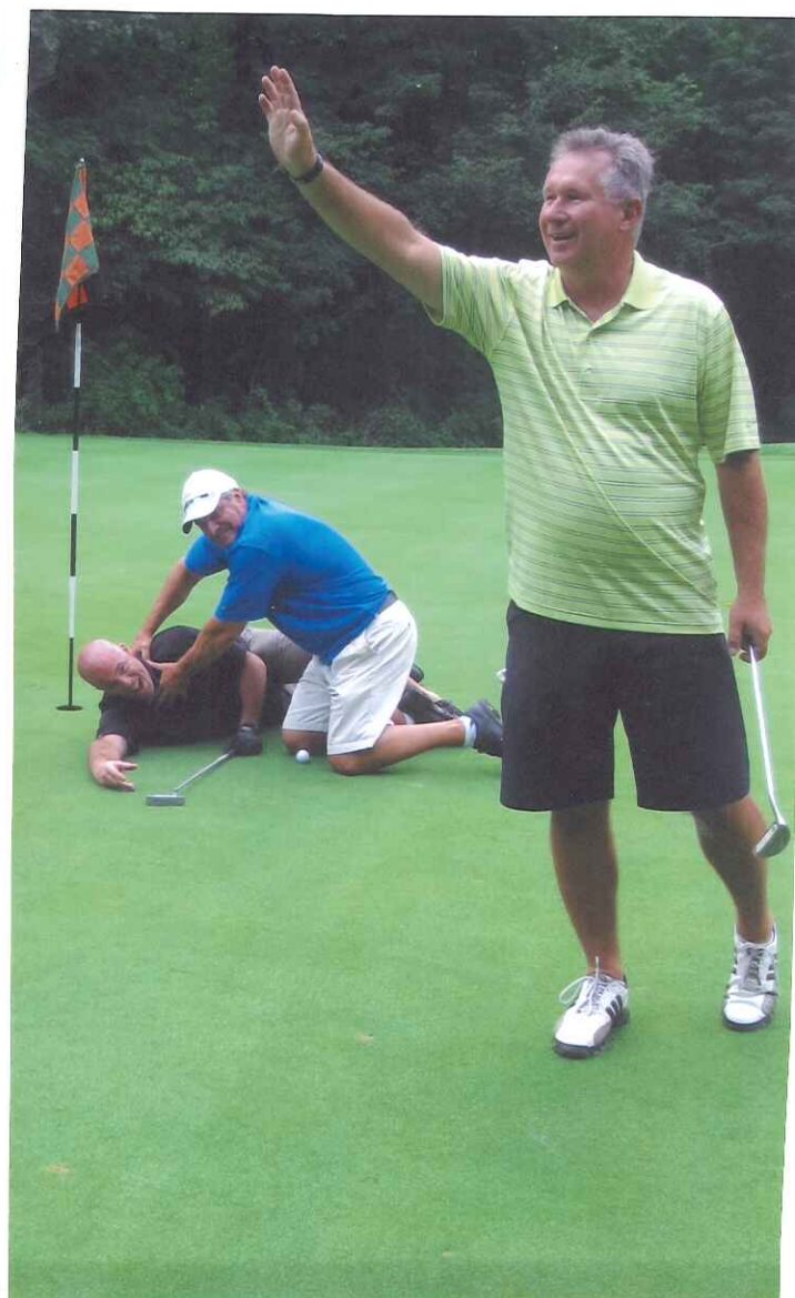
Jaworiwsky celebrates with an astounding round on Day 3