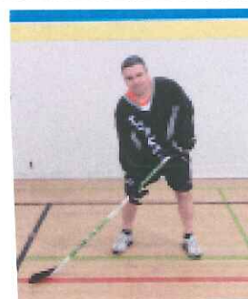
# 17 Sunny Salaris

Collecting $40 at start of season for beer, Web Site, paraphernalia & incidentals.