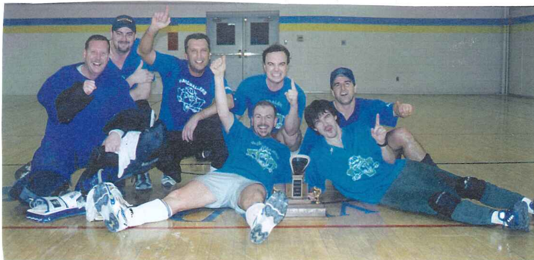
2003 Stanley's Cup Champions 'Finner Hardballers'

Kapusta Kow Palace, Saturday February 23, 2013