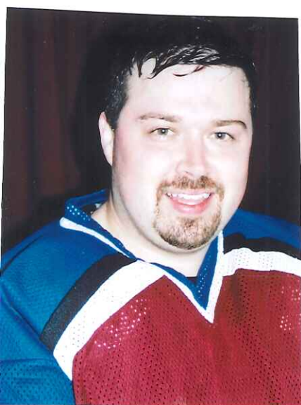
"I would love to come back and play full time if the Tomcats give me the opportunity"