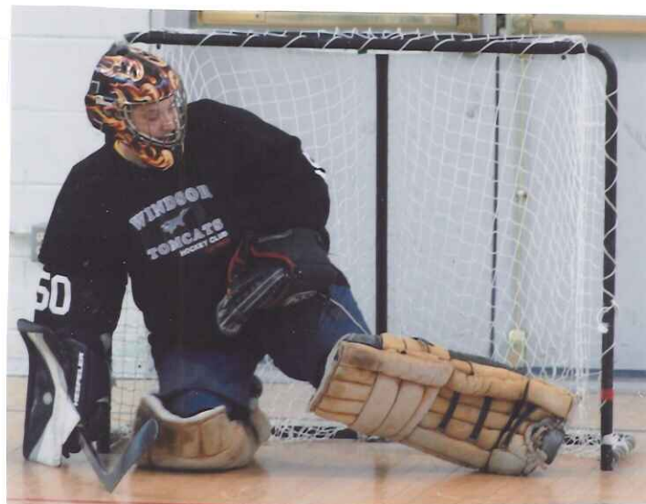
"I know I am low on the Tomcat goalie depth chart I will just work hard in camp and try to show them what I got"

Tomcats are holding their cards close to their chest on other goalie fronts the St. Felix was told.