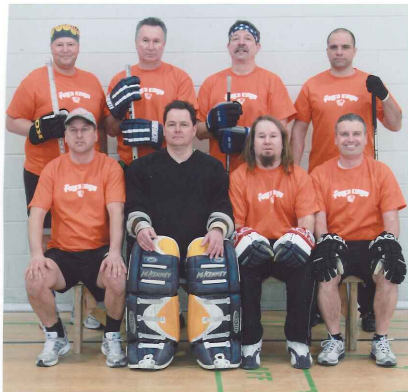
The Polka Kings