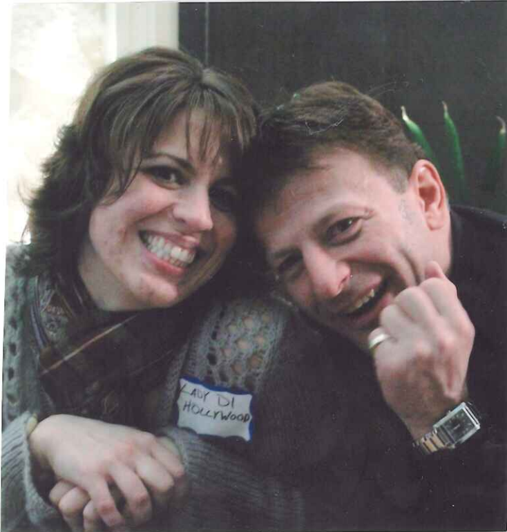
A fan gets to meet Snowpants

N/A; not eligible on the defending Champion team.