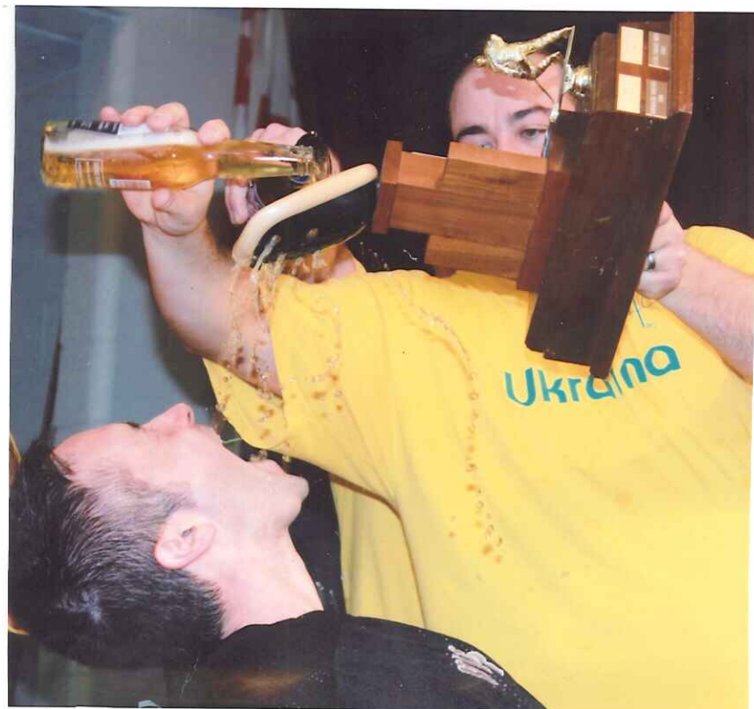
A pour from the Stanley's Cup...there is nothing like it.....(Not a sip...a pour!)